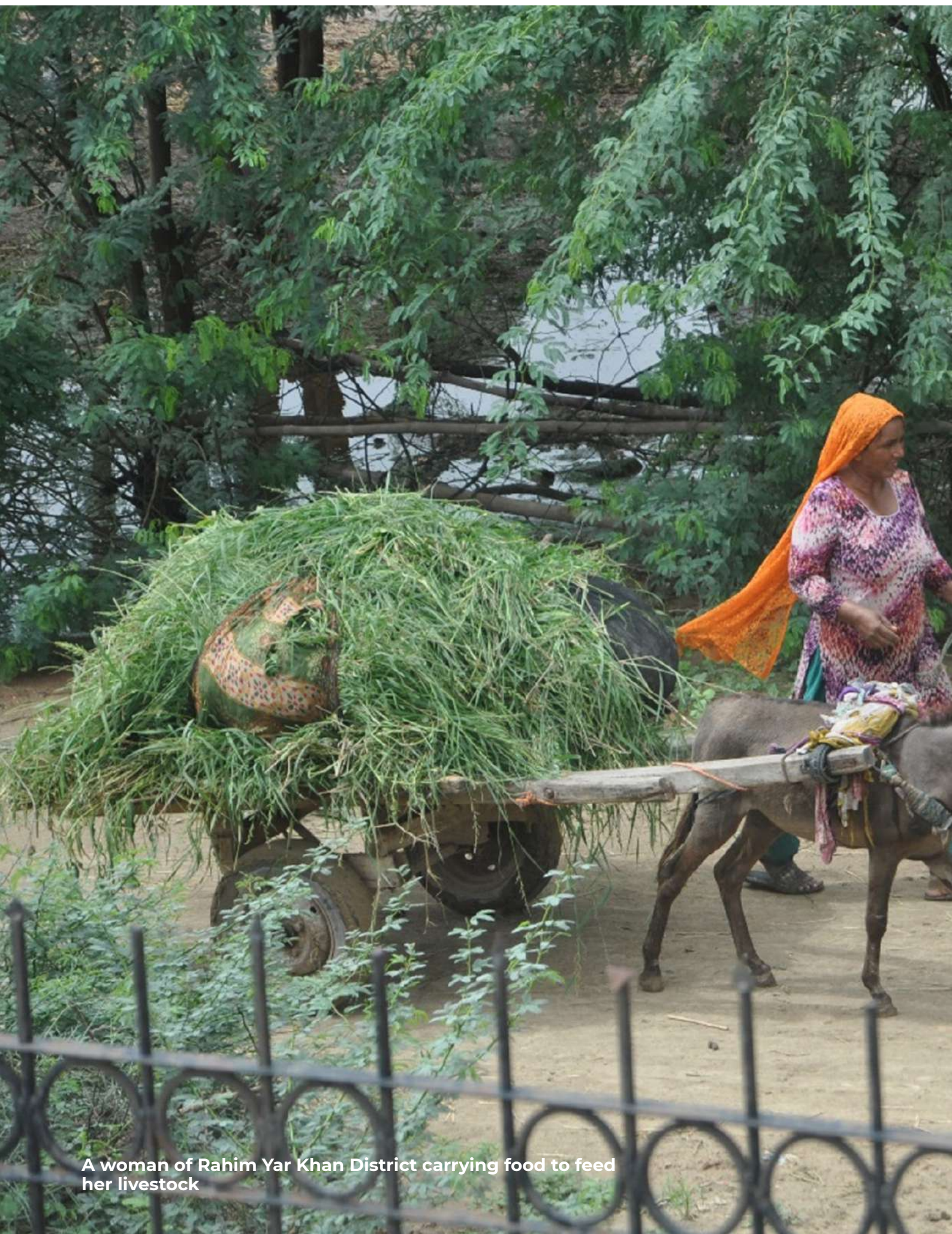
A woman of Rahim Yar Khan District carrying food to feed her livestock