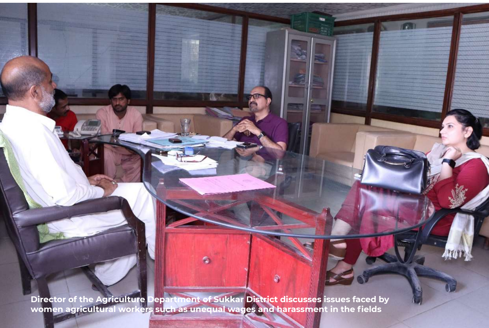
Director of the Agriculture Department of Sukkar District discusses issues faced by women agricultural workers such as unequal wages and harassment in the fields

to safety gear. The representative from the Agriculture Department concede that the sprays are indeed harmful; however, the Deputy General of the Welfare Department was of a different opinion, insisting that the sprays are not harmful. A representative from the Human Rights Commission of Sindh clarified that women in rural areas are neglected, and often do not receive proper nutritious diets, which results in poor health and leaves them prone to diseases. This, in turn, affects their productivity. She also expressed alarm over pregnant women being forced to carry out challenging work on farms, which is detrimental to both the women and their unborn children.