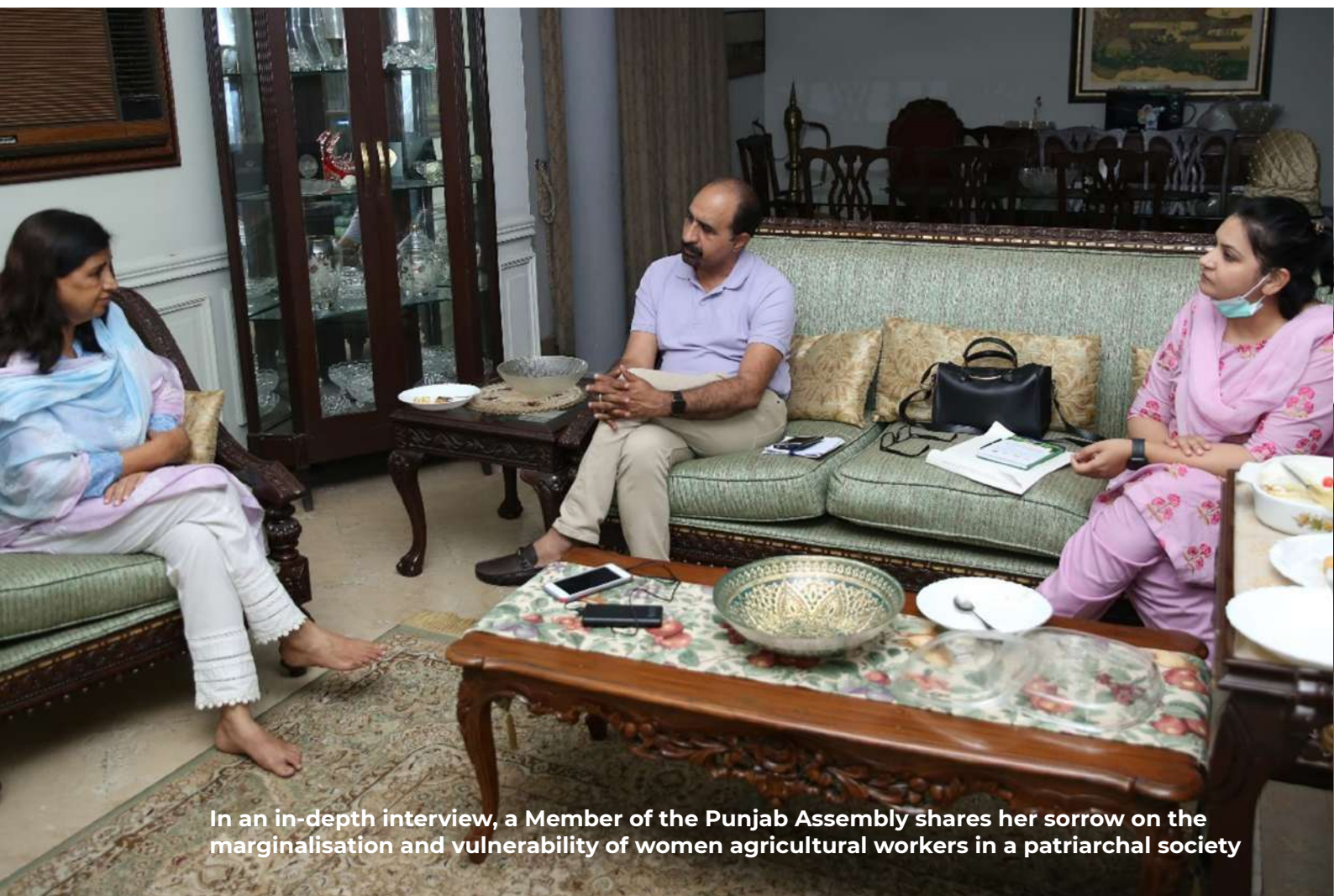
In an in-depth interview, a Member of the Punjab Assembly shares her sorrow on the marginalisation and vulnerability of women agricultural workers in a patriarchal society

marriages and other family functions. In Sindh, it was shocking to observe that males in rural areas do not work full-time, and are instead engaged in informal labour, only to squander their earnings on gambling. This alarming phenomenon further deteriorates household incomes and exacerbates already dire family economic conditions.