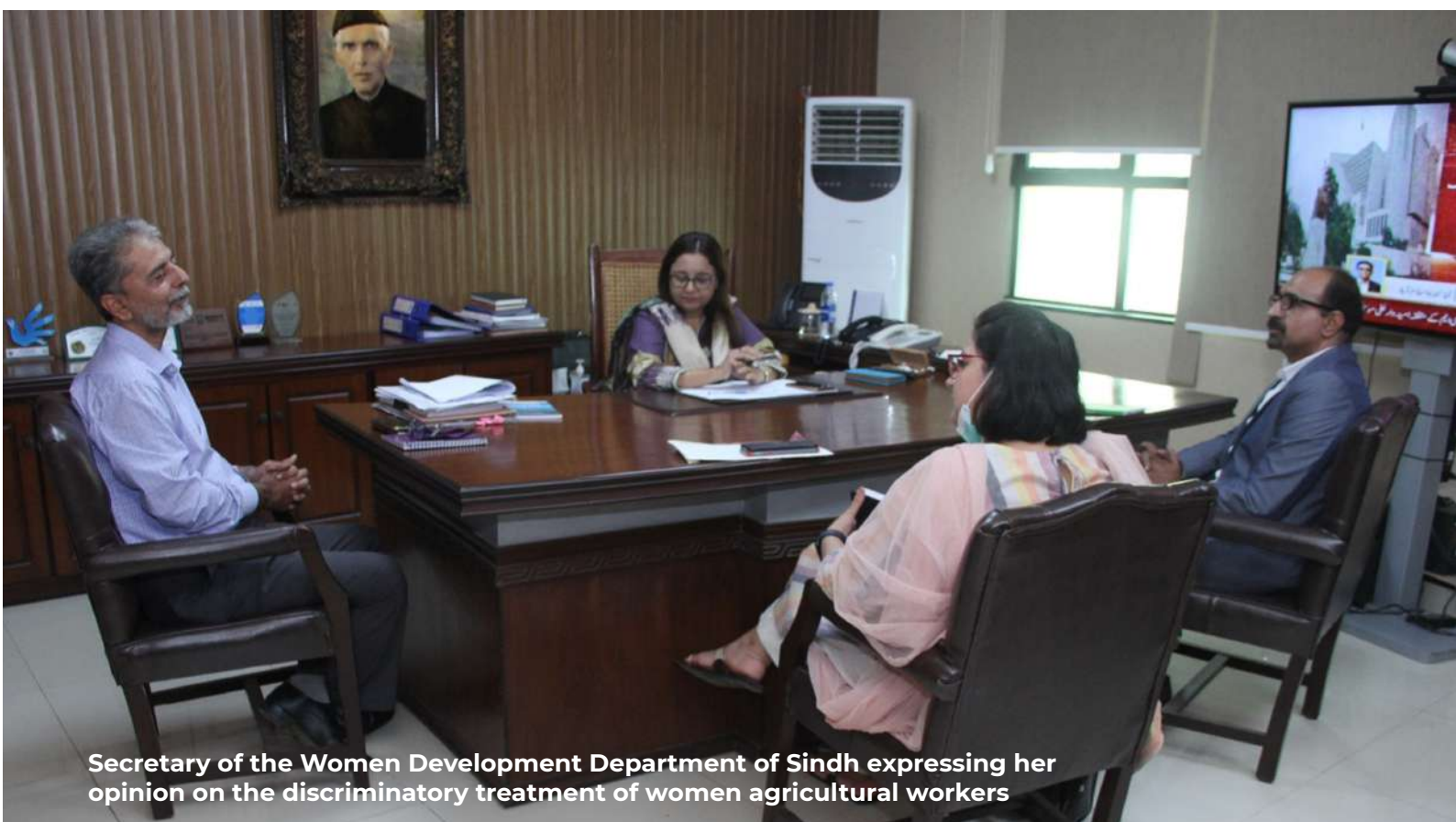
Secretary of the Women Development Department of Sindh expressing her opinion on the discriminatory treatment of women agricultural workers

women is part of a broader scheme of systemic gender inequality in the country. 22 Women are dominated not only by their husbands but also by male members of the family. The majority of women are deprived of their right to education.