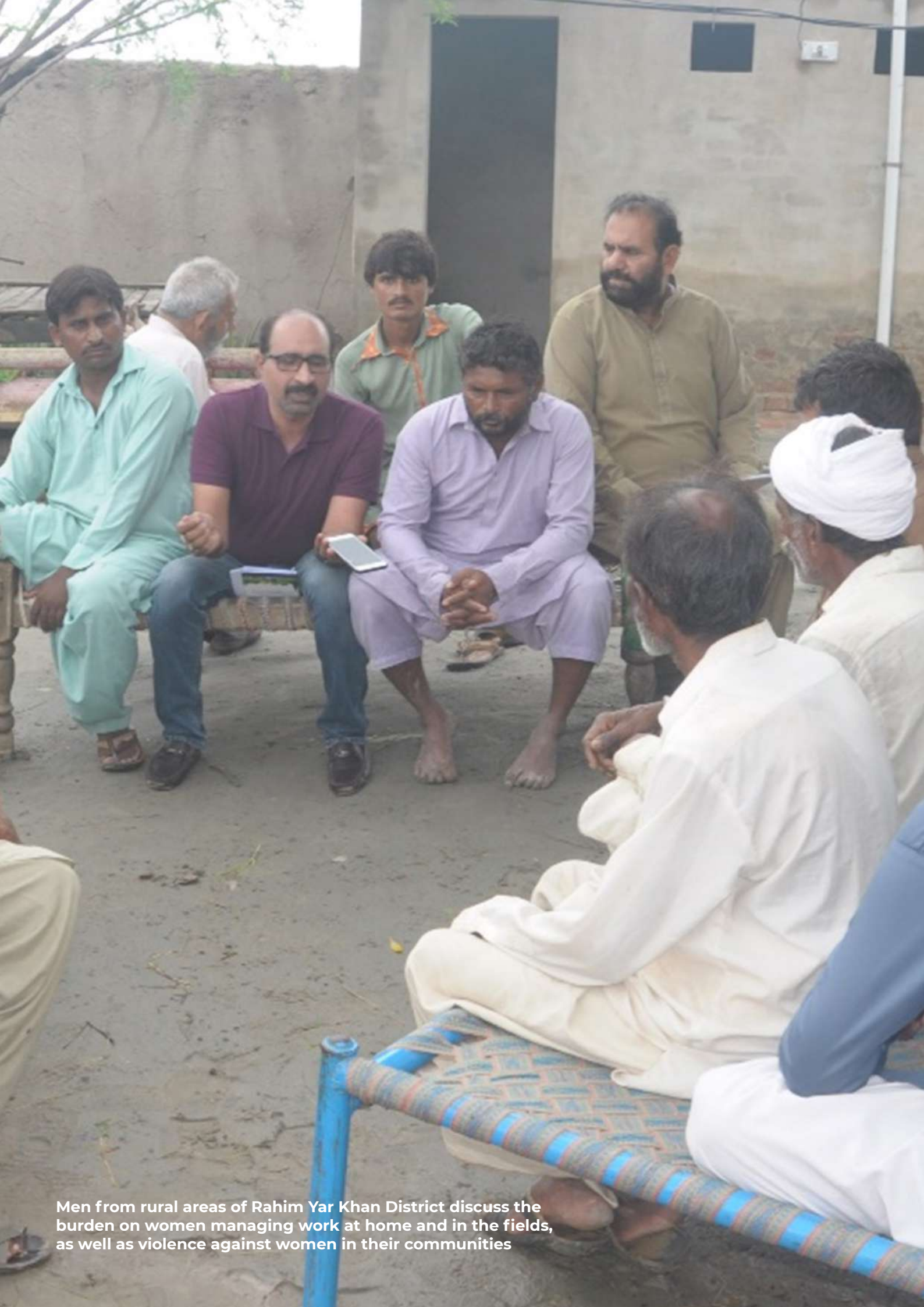
Men from rural areas of Rahim Yar Khan District discuss the burden on women managing work at home and in the fields, as well as violence against women in their communities