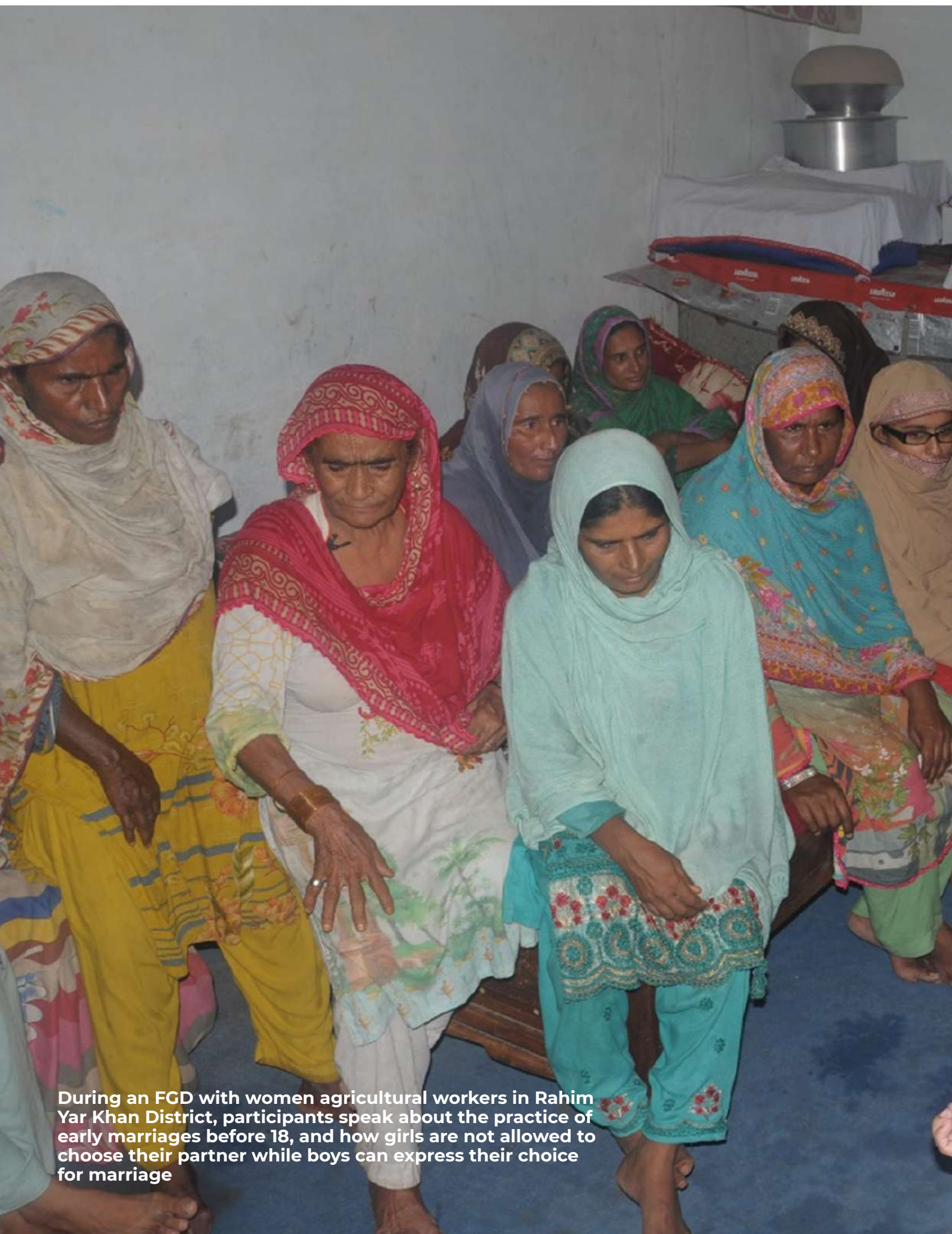
During an FGD with women agricultural workers in Rahim Yar Khan District, participants speak about the practice of early marriages before 18, and how girls are not allowed to choose their partner while boys can express their choice for marriage