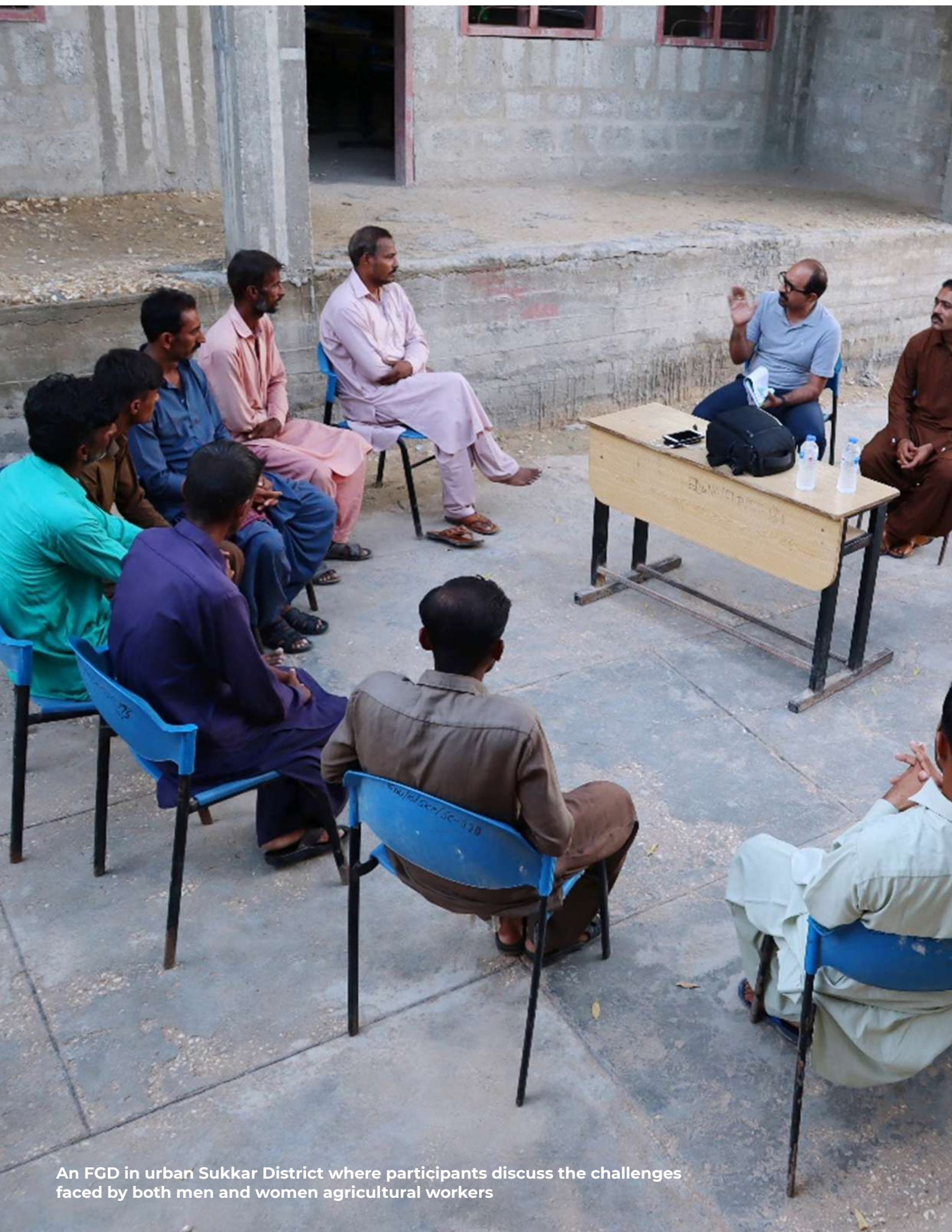
An FGD in urban Sukkar District where participants discuss the challenges faced by both men and women agricultural workers