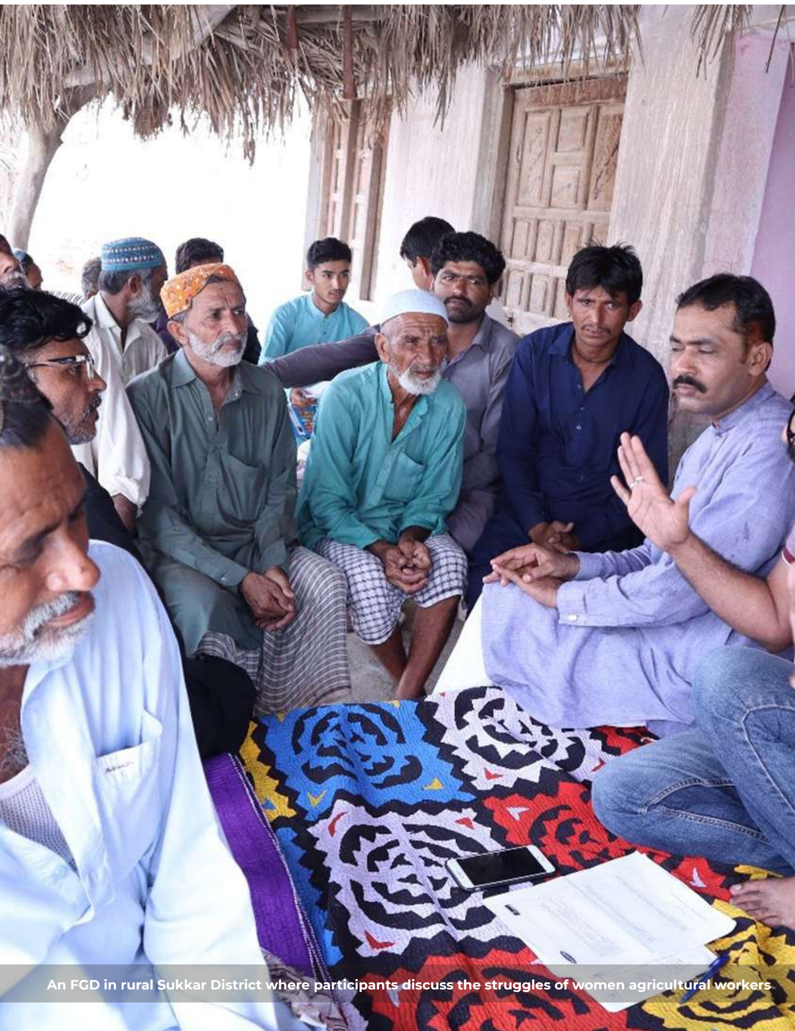
An FGD in rural Sukkar District where participants discuss the struggles of women agricultural workers