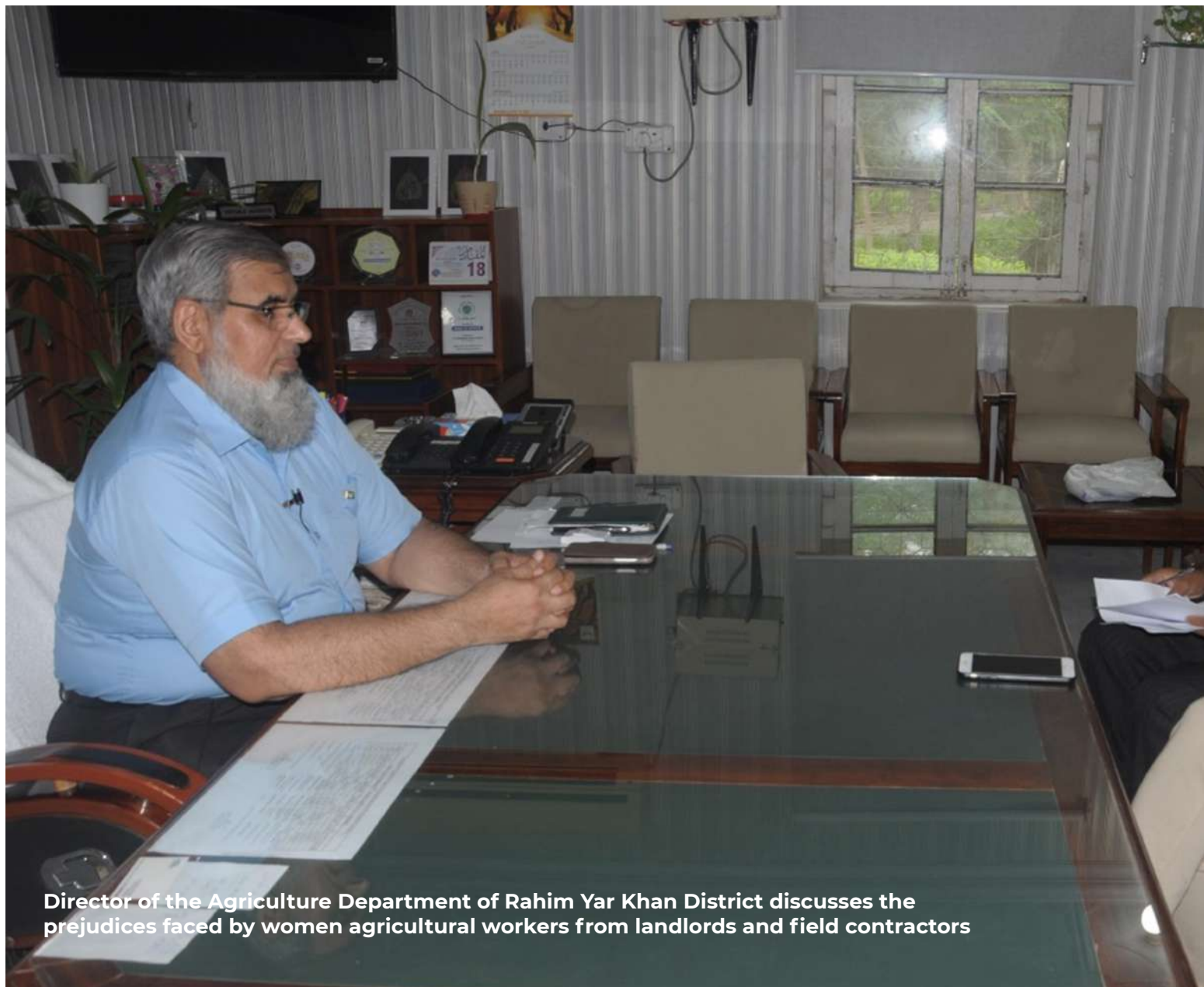
Director of the Agriculture Department of Rahim Yar Khan District discusses the prejudices faced by women agricultural workers from landlords and field contractors

The traditional roles of female and male agricultural workers are different. Both in Sindh and Punjab, the men prepare land for crops, use tractors or technology to sow seeds, irrigate using canal systems, and use machines to spray pesticides. The women, on the other hand, are mostly engaged in weeding, removing waste stubble and taking care of crops, but are not allowed to harvest. The men in Sindh make crop-sharing arrangements and agreements with landlords, while the women do not. The Director of the Agriculture Department disclosed that in rural areas, only women pick cotton because it is considered a woman's job due to prevailing patriarchal mindsets.