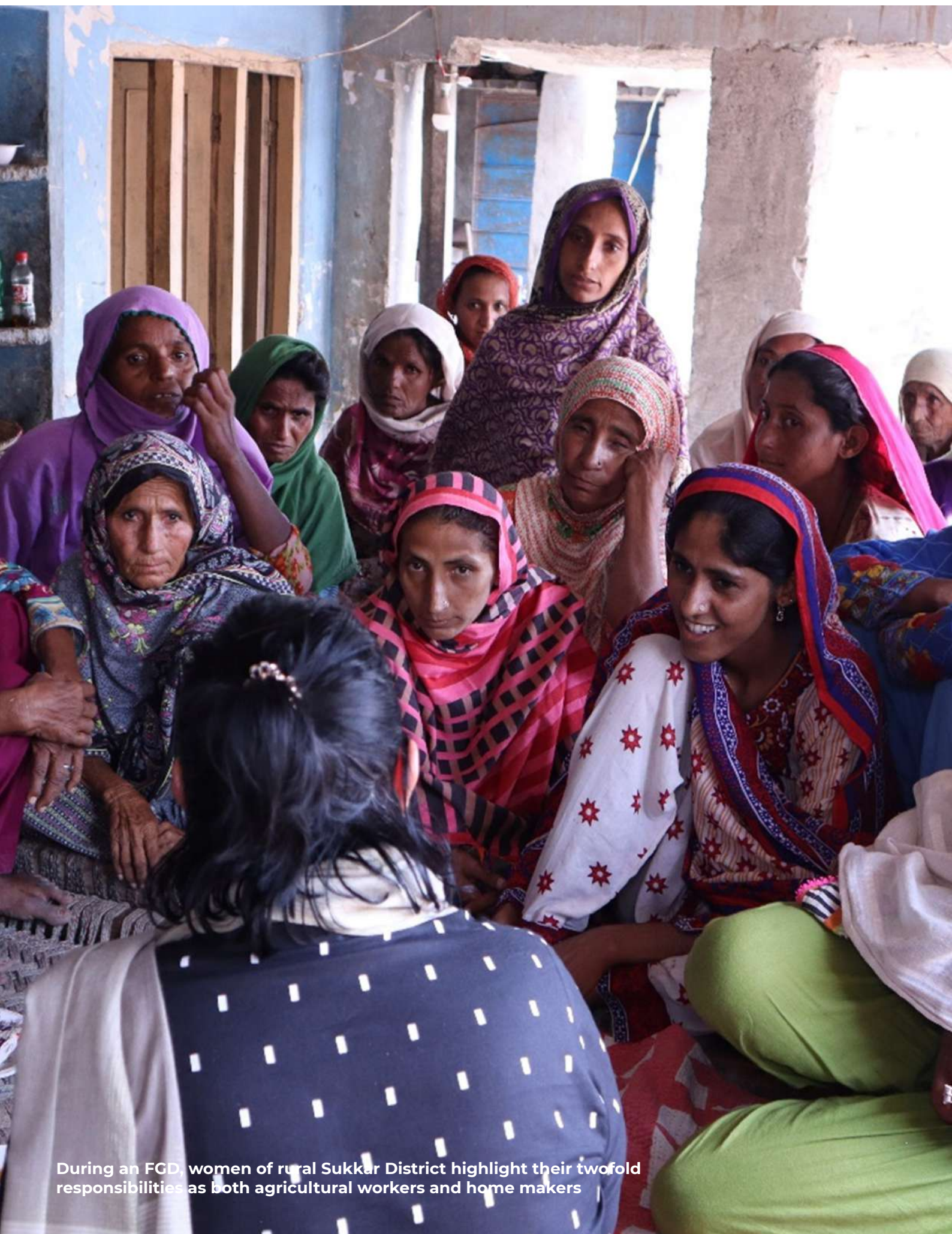
During an FGD, women of rural Sukkur District highlight their twofold responsibilities as both agricultural workers and home makers