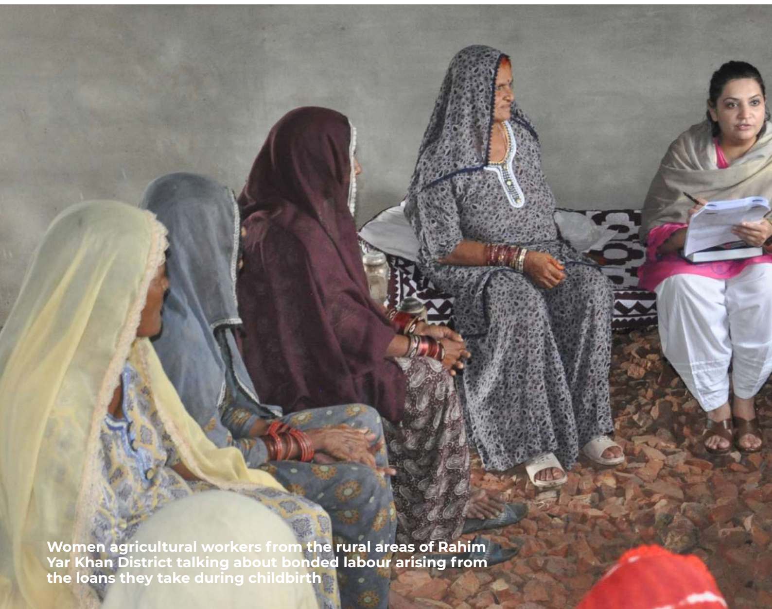
Women agricultural workers from the rural areas of Rahim Yar Khan District talking about bonded labour arising from the loans they take during childbirth

part, refused to recognise this issue, claiming that factory workers are paid equally, but they do not have data on WAWs due to in-field limitations.