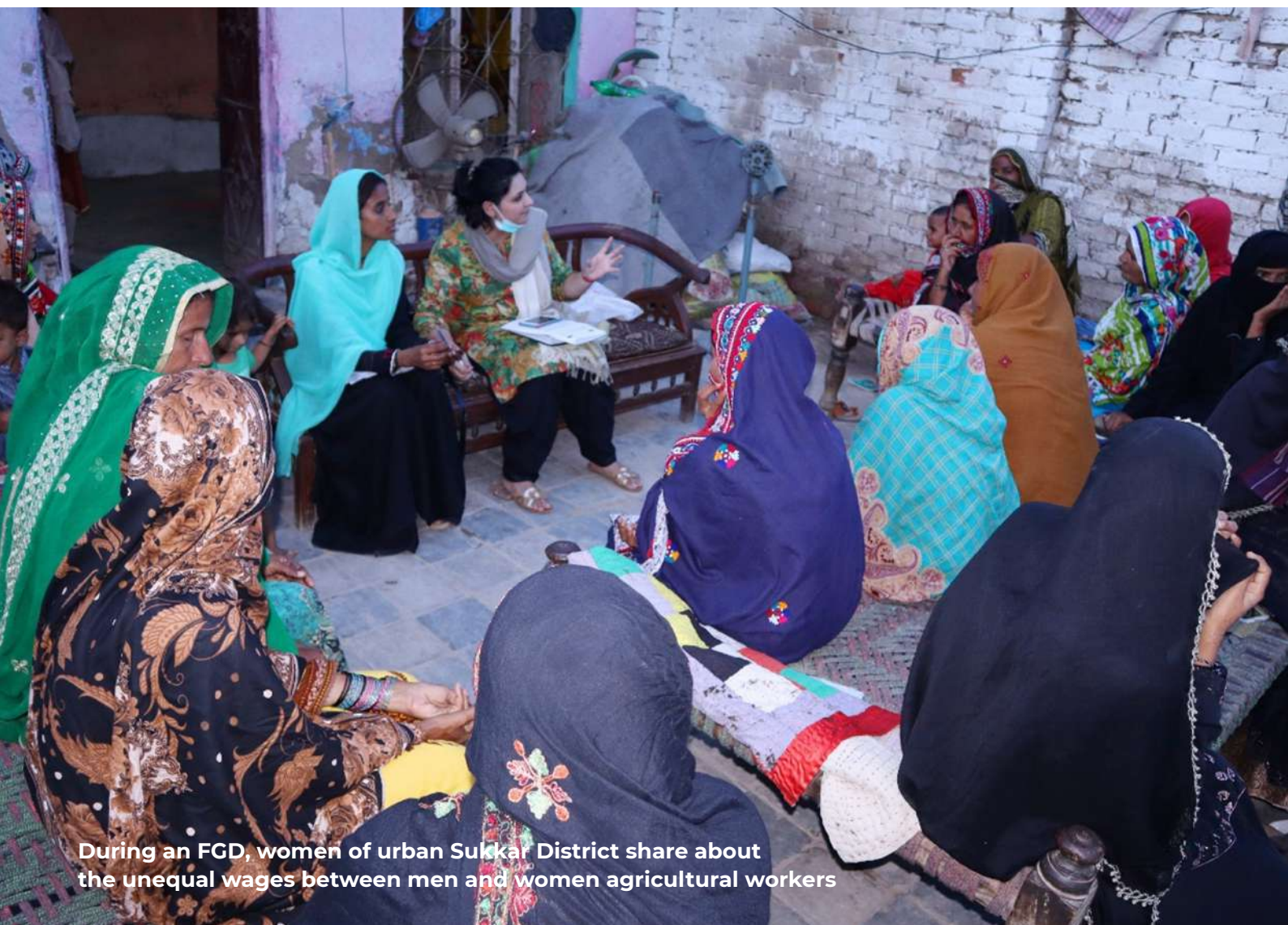
During an FGD, women of urban Sukkar District share about the unequal wages between men and women agricultural workers

boards in the province. 19 which has empowered the women working in the agricultural sector there, but such an Act is yet to be passed in Punjab and other provinces. Furthermore, the quality and quantity of research related to women's issues is not sufficient and does not meet international standards. Large-scale surveys to identify problems facing rural women in different agroecological and socioeconomic zones need to be conducted to plan and implement programmes that address the issues and constraints faced by women vis-à-vis the agricultural sector.