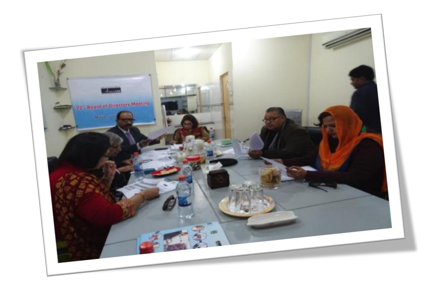
22nd Board of Directors meeting

http://pda.net.pk/wp-content/uploads/2016/01/Where-Pakistan-Stands-on-SDGs-2018.pdf