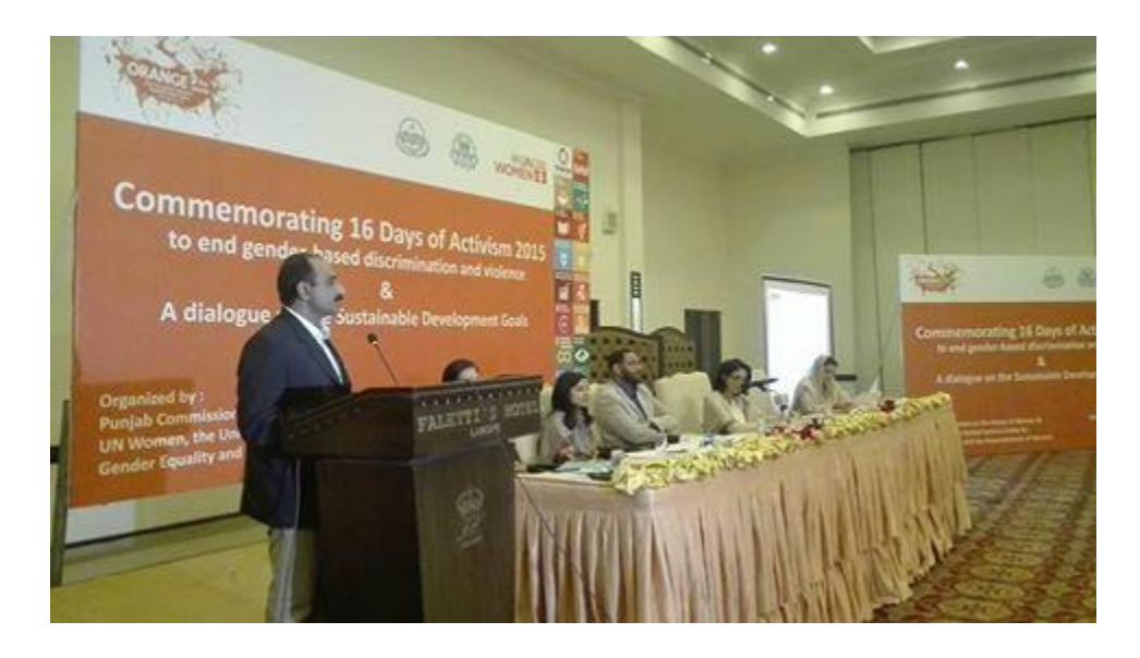
Participating in PCSW event