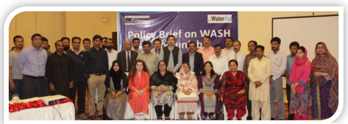
Policy Brief on WASH with LCG members

AWAZCDS formulated a "legislatures Core Group on WASH" in Punjab Assembly based on the Members of Provincial Assembly (MPAs) Punjab with equal gender and geographical representation. The main purpose of this Core group was to highlight the fundamental issues regarding WASH, its policies, budget allocation & distribution and developing logical strategic planning for tackling the issues in a smart way. Project staff of AWAZCDS usually legislatures were engaged in capacity building training, meetings, and exposure opportunities at national and international level and enhanced their interest in rights based agendas.