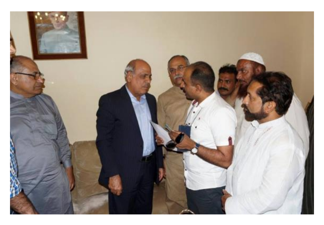
CE Sharing AwazCDS projects with Governor Punjab.