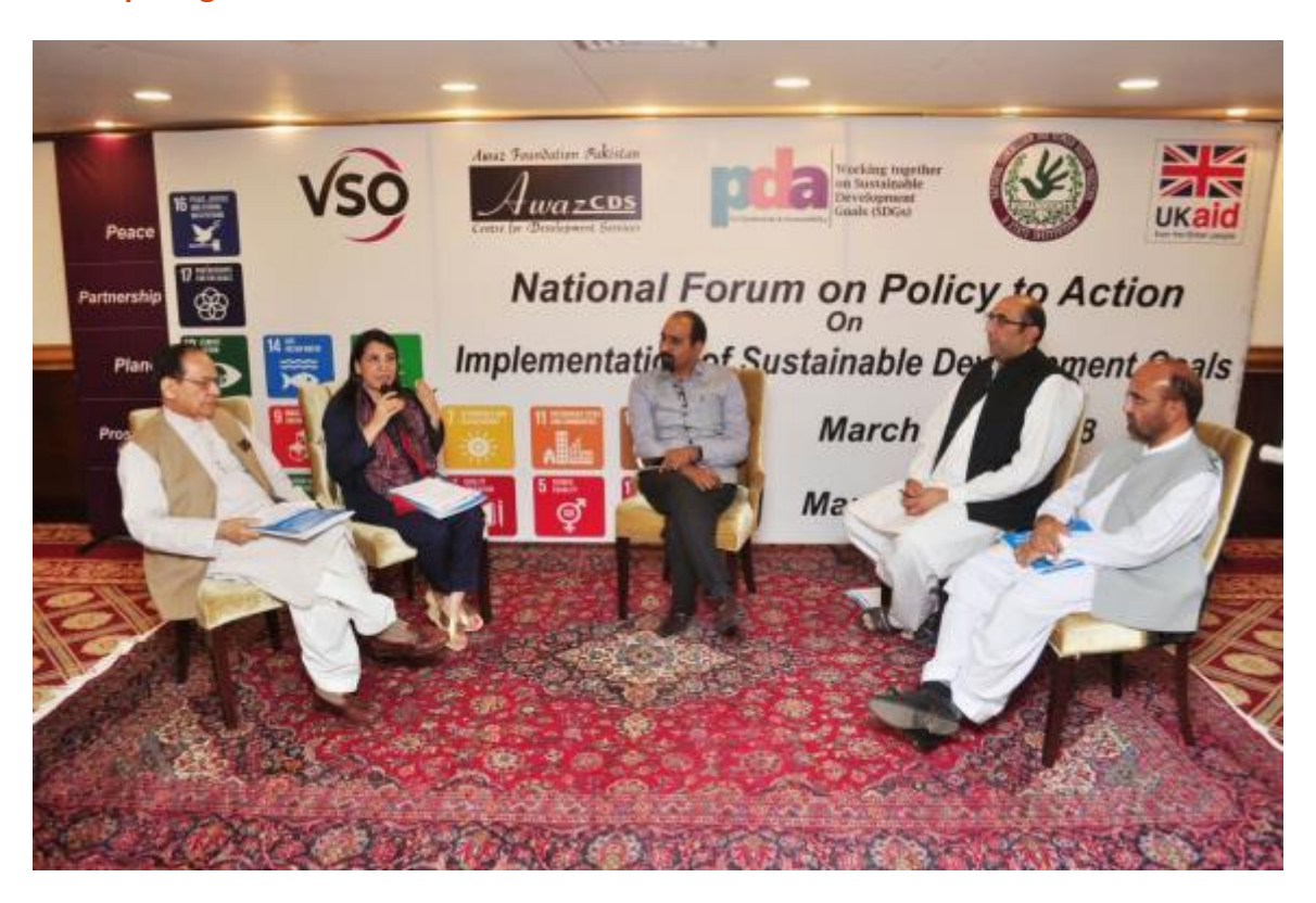
National Forum on Policy to Action on Implementation of SDGs