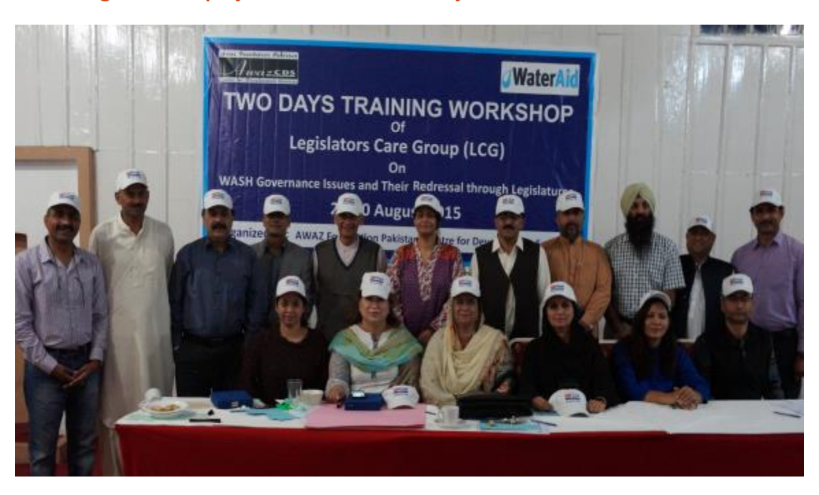
Engaging parliamentarians under LCG program